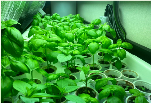
Dougherty Valley/ APES