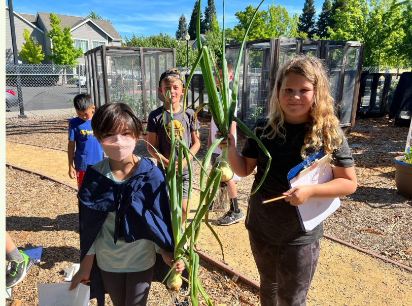
Green Valley Elementary